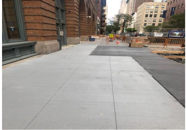
Newly reconstructed concrete sidewalk pattern along E. 25 th St. between Lexington and 3 rd Avenues looking Northwest.